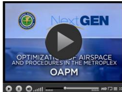
Metroplex Informational Video

In response to recommendations from the aviation community through RTCA's NextGen Mid-Term Implementation Task Force, the FAA is putting integrated NextGen capabilities in place to improve air traffic flow for an entire region, or metroplex. The FAA has identified 21 sites that include several commercial and general aviation airports in close proximity serving large metropolitan areas.