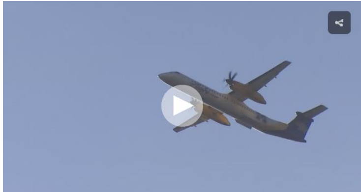
An environmental watchdog group is calling attention to what it believes are noise and health concerns in the skies above Beacon Hill.

(click on images to view source tweets by Joel Moreno)